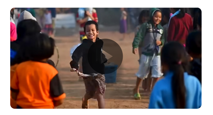
Helping ALIGHT (formerly known as American Refugee Committee) Serenic (now Sylogist) adds

Serenic (now Sylogist) adds efficiency to important work.